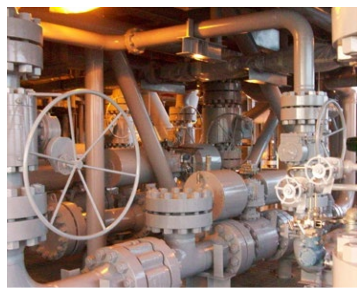
Production valves are the first line of defense to ensure safety and operational reliability offshore.

For extreme service conditions, our TK* trunnion-mounted ball valves utilize robust components designed around wide seat sealing surfaces and optional non-corrosive plated or weld over-lay on internal wetted surfaces making it ideal for pre-separation offshore. TK ball valves are available in a variety of stainless steel and high-nickel alloys which can be applied to the valve's critical areas, thus improving valve performance and increasing service life.